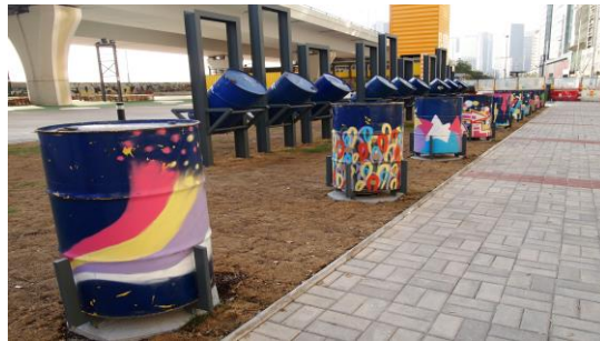
Fly the Flyover 01, Energizing Kowloon East 起動九龍東反轉天橋底一號場