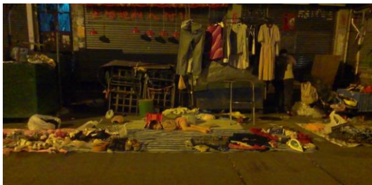
Streets near Pei Ho Street Market 北河街街市附近的街道