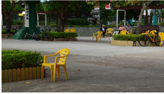
Lo Peng Street, Peng Chau 坪洲露坪街