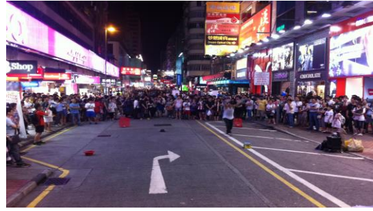
Mongkok Pedestrian Area 旺角行人專用區