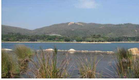
Inspiration Lake 迪欣湖