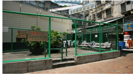
Yan Oi Court Garden 仁愛閣休憩花園