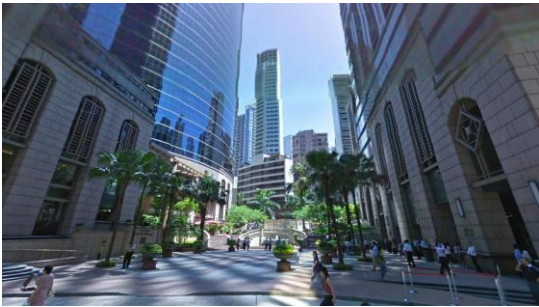
Grand Millennium Plaza 上環新紀元廣場