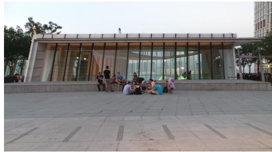
Roof Garden at IFC IFC 平台花園