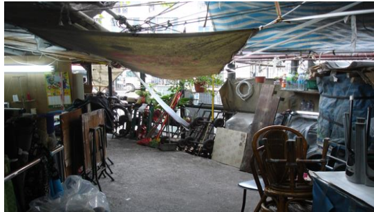
Yen Chow Street Hawker Market 欽州街小販市場