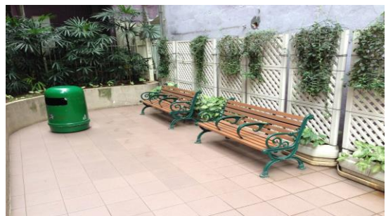
Queen's Road East / Swatow Street Sitting-out Area 皇后大道東/汕頭街休憩處