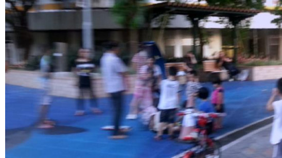
Shek Kip Mei Estate Children Play Area 石硤尾邨兒童遊樂場