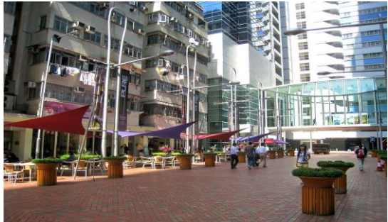
Tong Chong Street, Taikoo Place 太古坊糖廠街