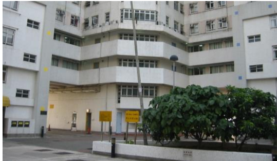
Roundabout at Sassoon Road Residence, HKU 香港大學沙宣道學生宿舍迴旋處