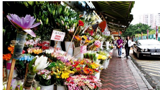
Flower Market 花墟