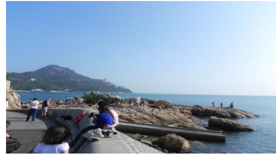
Stanley Promenade 赤柱海濱長廊