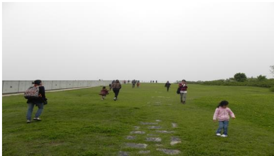
Accessible Grass Roof at Wetland Park 香港濕地公園綠化屋頂