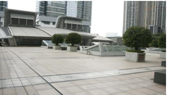
Kowloon Station Podium Garden 九龍站上蓋空中花園