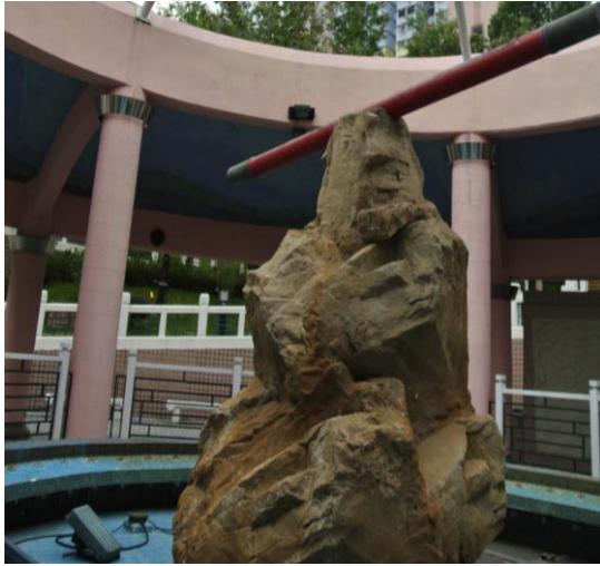
Wong Tai Sin Fung Tak Park 黃大仙鳳德公園