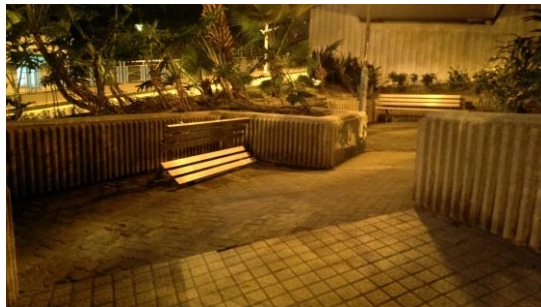
Sitting-out Area in Admiralty 金鐘休憩處(介乎金鐘道與正義道)