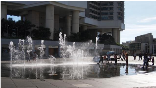
Plaza outside Citygate Outlets 東薈城廣場