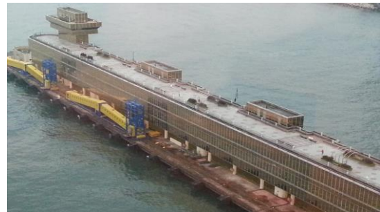
Rooftop of China HK Ferry Terminal 中港碼頭天台