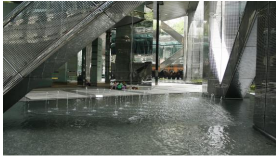
Public Space of the Center 中環中心公共空間