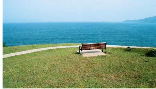
Tap Mun (Grass Island), Sai Kung 西貢塔門