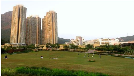
Jordan Valley Park 佐敦谷公園