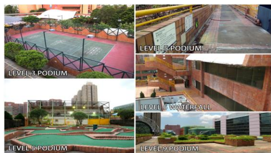
New Town Plaza Phase 1, Podium on 3/F, 5/F and 9/F 新城市廣場一期 3 樓、5 樓及 9 樓平台