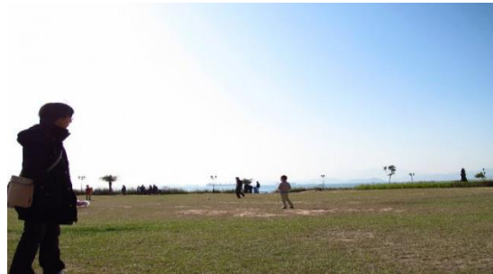
Cyberport Waterfront Park 數碼港海濱長廊